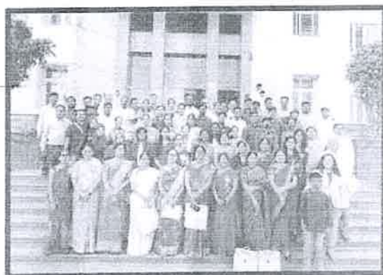
Glimpses of Alumni Meet-V